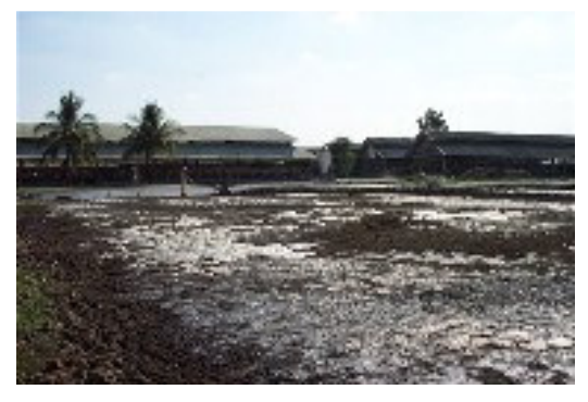
Figure 1 Lagoon, The Local Common Practice

HBC proposes an alternative manure waste management system to recover methane gas emissions as an alternative to the current open lagoon systems. Wastewater treated in these lagoons is often at an ambient temperature of around 35°C, and under anaerobic conditions. The result of this is that biogas methane is emitted continuously from lagoons as can be seen in this typical farm lagoon system image.