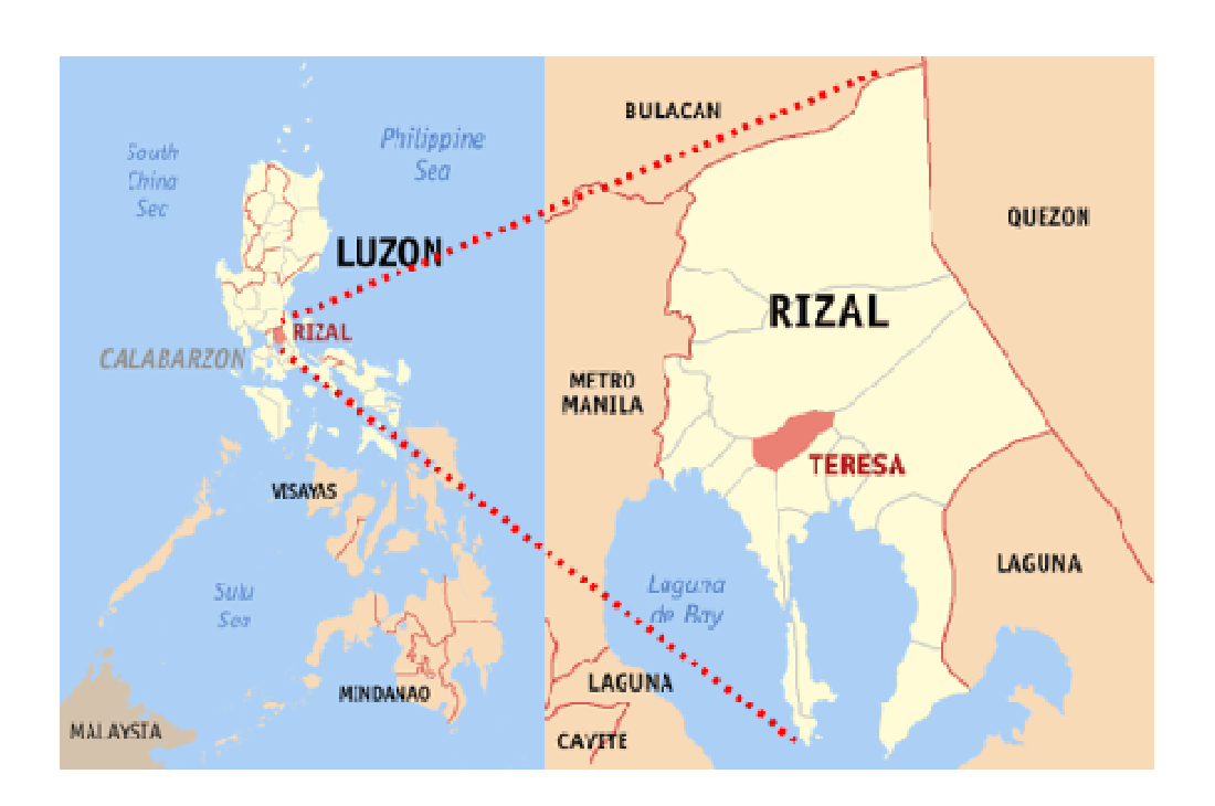
Figure 3 Location Maps<sup>2</sup>